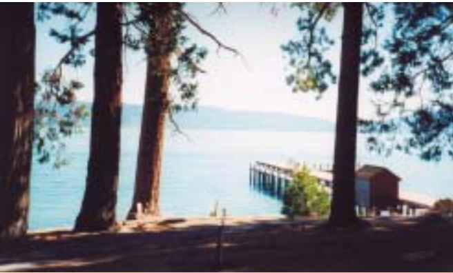
Sugar Pine Point has nearly two miles of lake frontage

The largest of the state parks at Lake Tahoe, Sugar Pine Point is 2,000 acres of dense sugar pine, fir, aspen and juniper forests set behind nearly two miles of lake frontage. This is the only Tahoe-area park where camping in the snow is part of the lake's winter experience. Located ten miles south of Tahoe City on the west side of Lake Tahoe, the park's acreage extends three-and-a-half miles into the U.S. Forest Service's Desolation Wilderness Area.