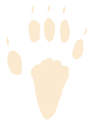
Gray Squirrel Track

Interpretive publications are available for many trails. Spring, summer and fall hikes are conducted if staff is available. Sugar Pine Point also hosts such winter activities as snowshoe and cross country ski outings led by park staff. Call or write to the park office for an interpretive guide or an activity schedule, or visit the Web site at www.parks.ca.gov .