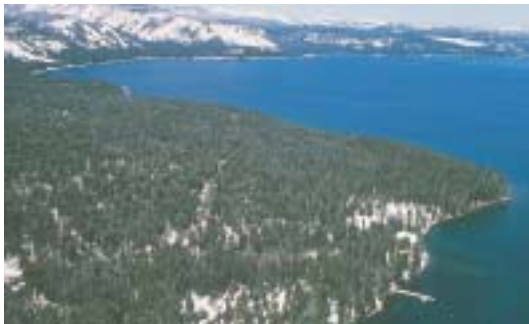
Aerial view of Sugar Pine Point State Park

During your visit you may also see evidence of various ongoing natural resource management programs. Erosion control, thinning of overcrowded forests, removal of dead trees in high-use areas, prescribed burning, and habitat improvement are a few of the many projects being undertaken to maintain, restore and preserve natural conditions within the park.