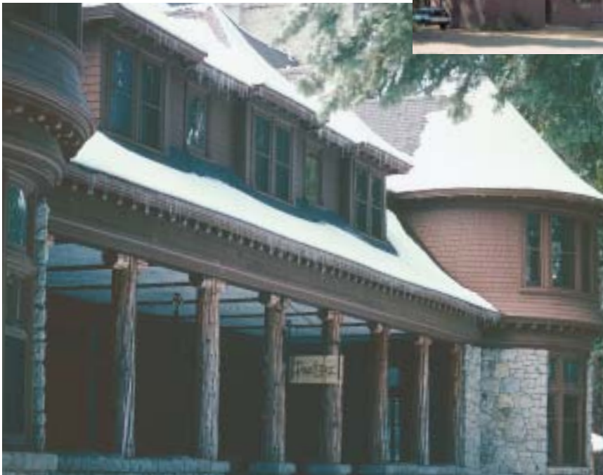
Pine Lodge (The Ehrman Mansion)

Nature Center and Gift Shop (Tank House)