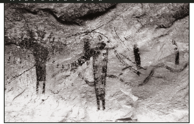
Pictographs of the Lower Pecos River Style adorn the canyon.