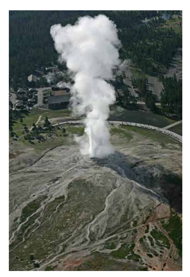
A raven's perspective on Old Faithful shows the web of runoff channels that connect the world's most famous geyser to the hydrothermal ecosystem.