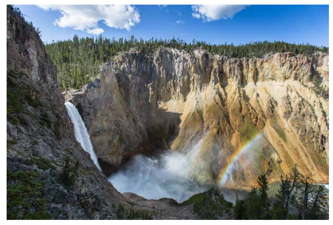
Stunning views of the Grand Canyon of the Yellowstone River are abundant along the rim trails.