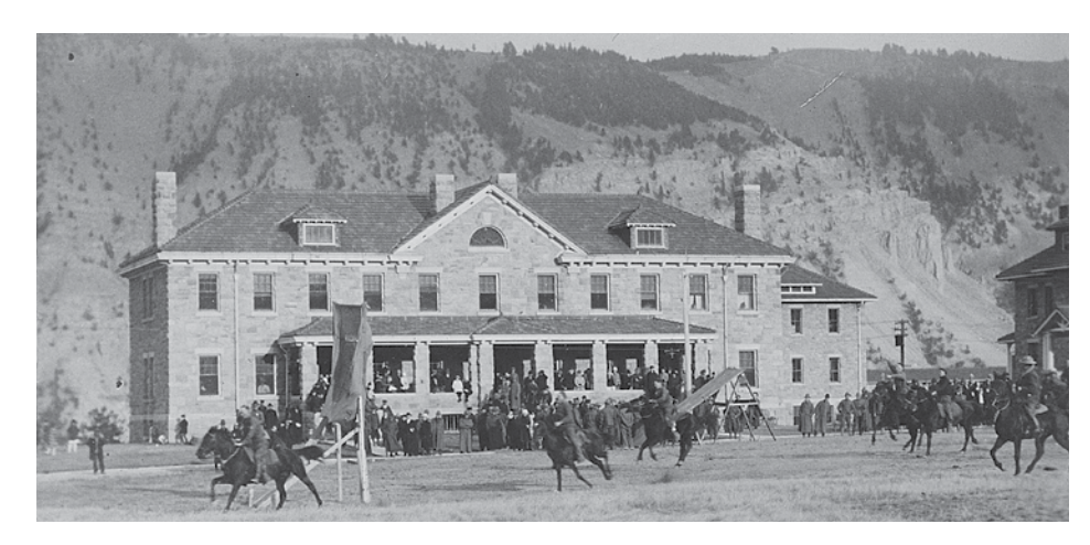
Cavalry soldiers conduct drills on the parade ground outside the bachelor officer's quarters in 1910, shortly after the building was constructed.

An orientation area with interactive displays offers enhanced trip planning information and park rangers give educational talks and tours throughout the year. Backcountry camping, boating, and fishing permits are available downstairs in the Mammoth Backcountry Office.