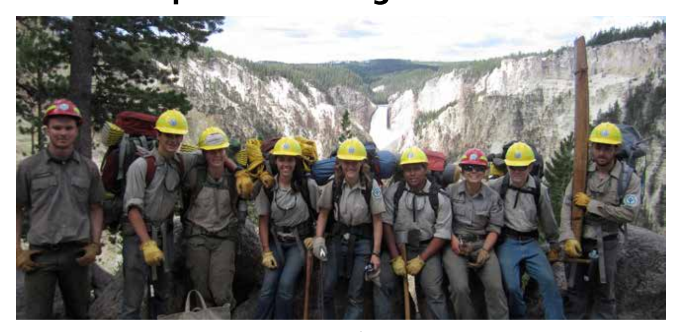
Yellowstone Conservation Corps participants will be one of the groups supported by the youth campus.