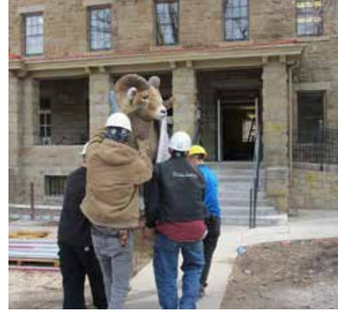
Walls were stripped down to original masonry, stabilized, insulated, and refinished. New exhibits were designed to highlight museum collection items.